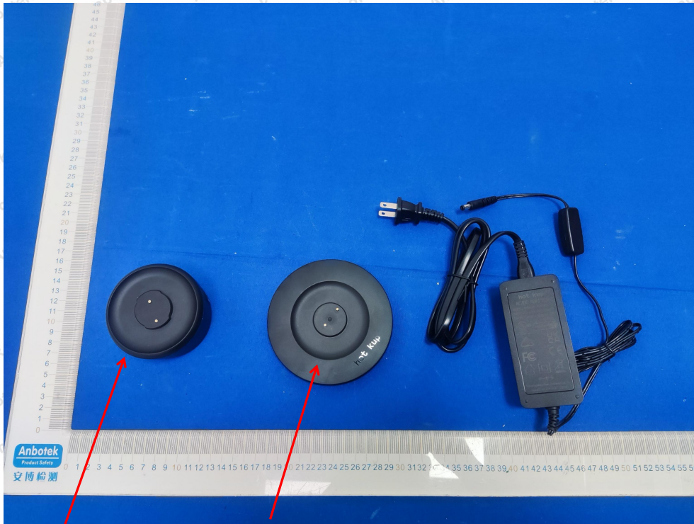
Cup base A