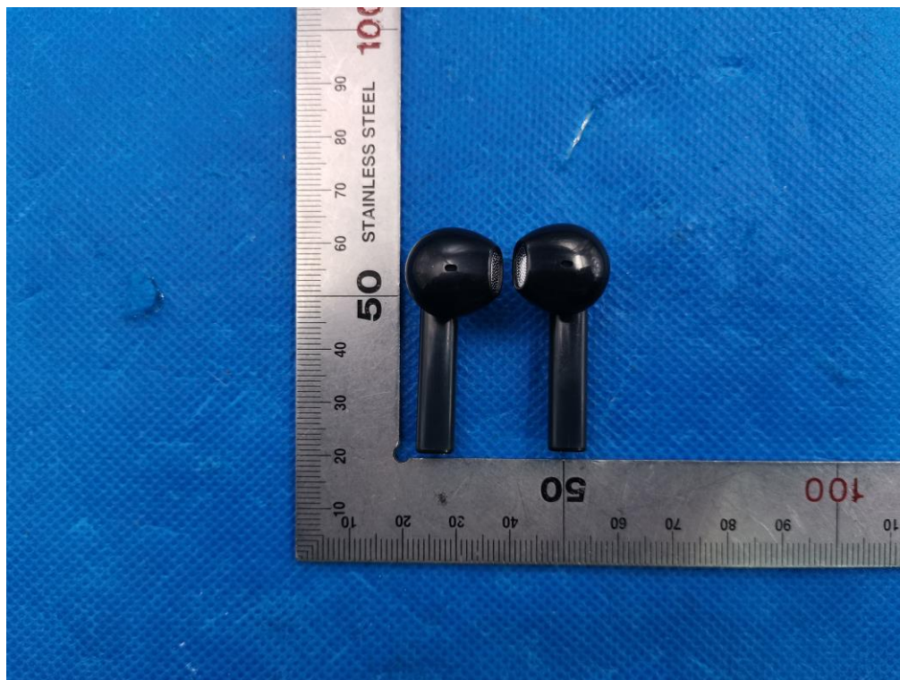
FRONT VIEW OF EUT