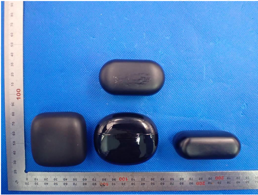
All VIEW-2 OF EUT