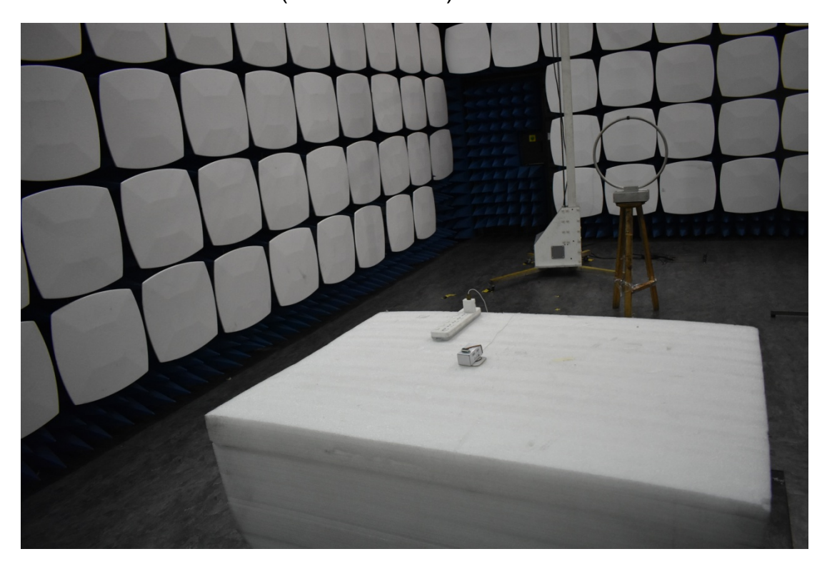
4. Radiated emission (30MHz-1GHz)