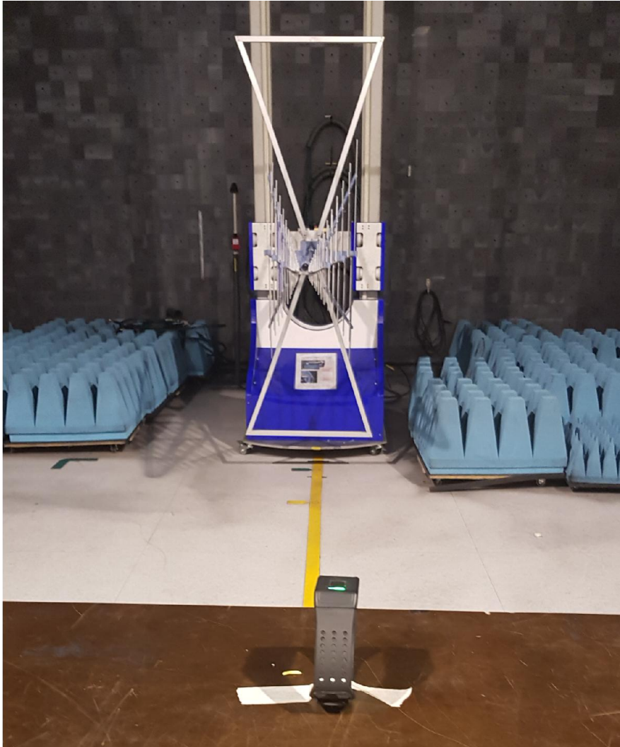
Test set up radiated emission 30 MHz – 1GHz