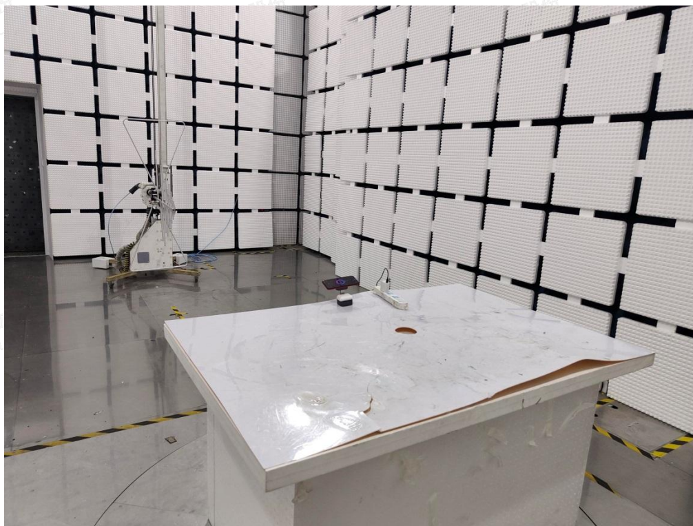
Radiated Emission below 1GHz-AC adapter charge mode