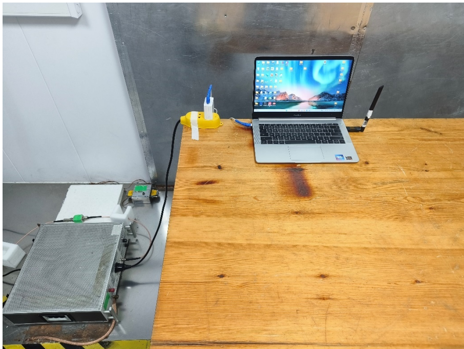
Test Photo 1