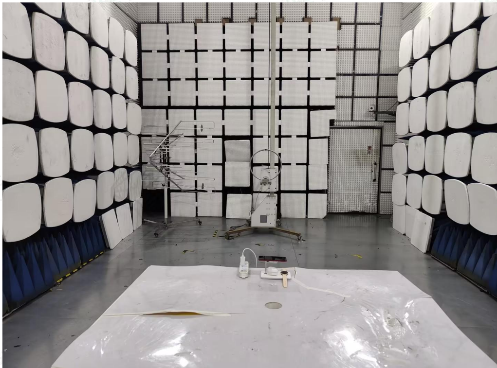
Radiated Emission below 30MHz-AC adapter charge mode