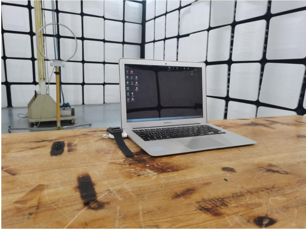
Photo of MPE Measurement