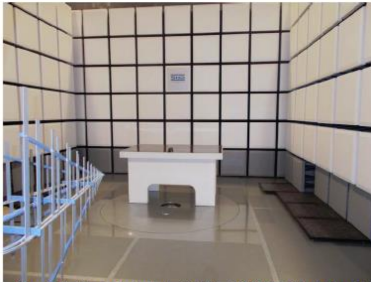
Figure 5: Radiated emission test – 200 MHz – 1000 MHz (without charger)