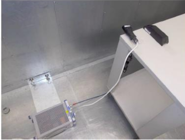
Figure 1: Conducted emission test