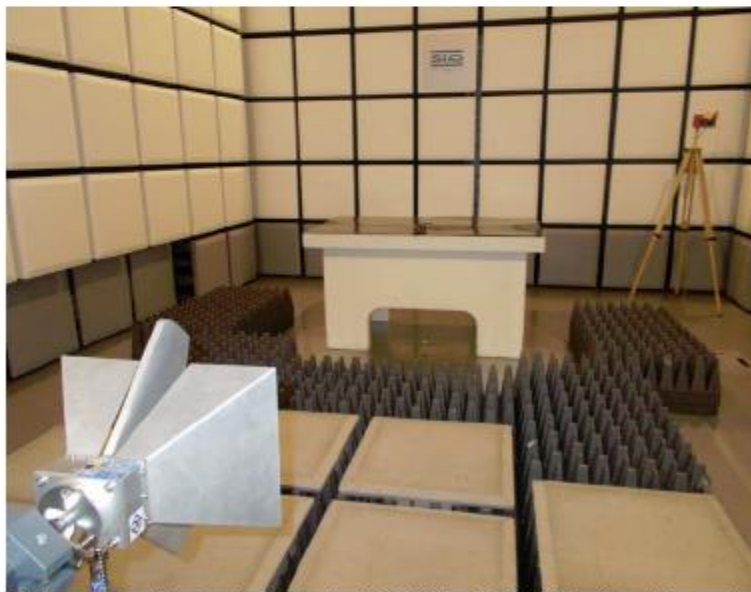
Figure 7: Radiated emission test – 1000 MHz – 6000 MHz (without charger)