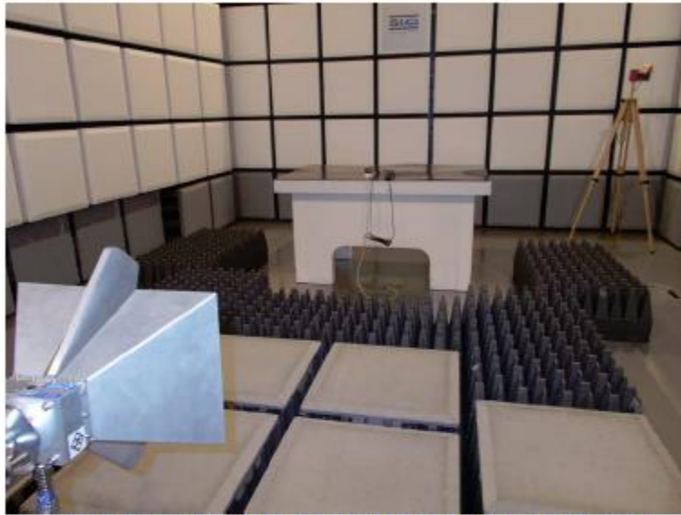
Figure 6: Radiated emission test – 1000 MHz – 6000 MHz (with charger)