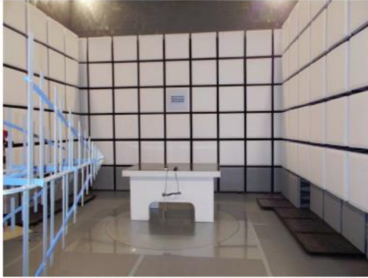
Figure 4: Radiated emission test – 200 MHz – 1000 MHz (with charger)