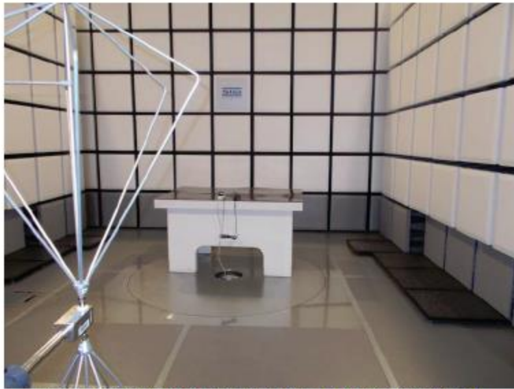
Figure 2: Radiated emission test 30 MHz – 200 MHz (with charger)