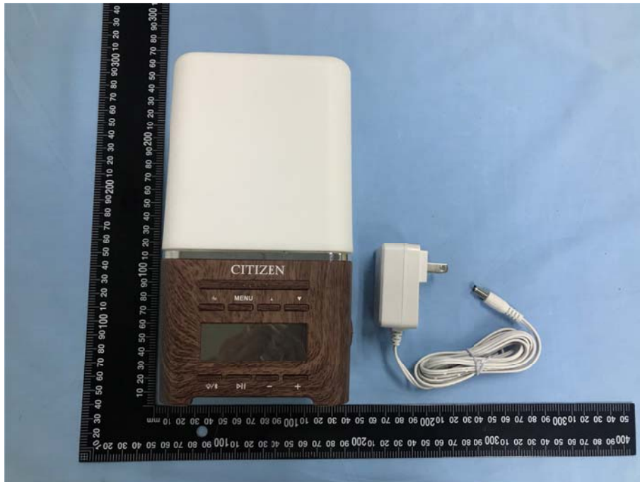
EUT View (1)