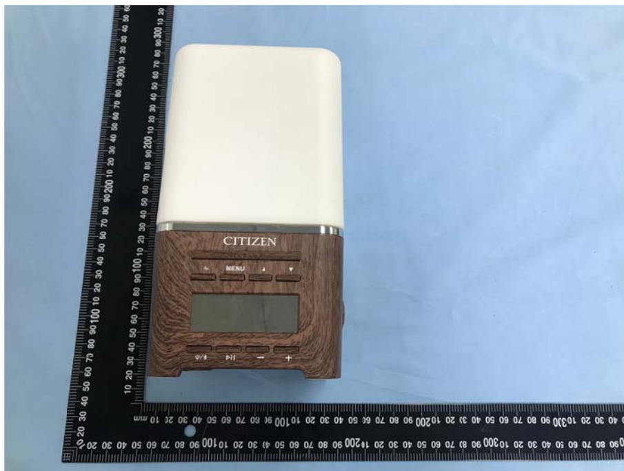
EUT View (2)