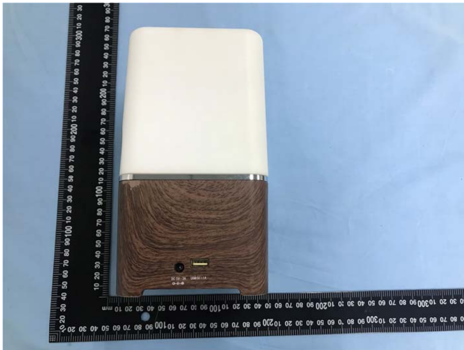
EUT View (4)