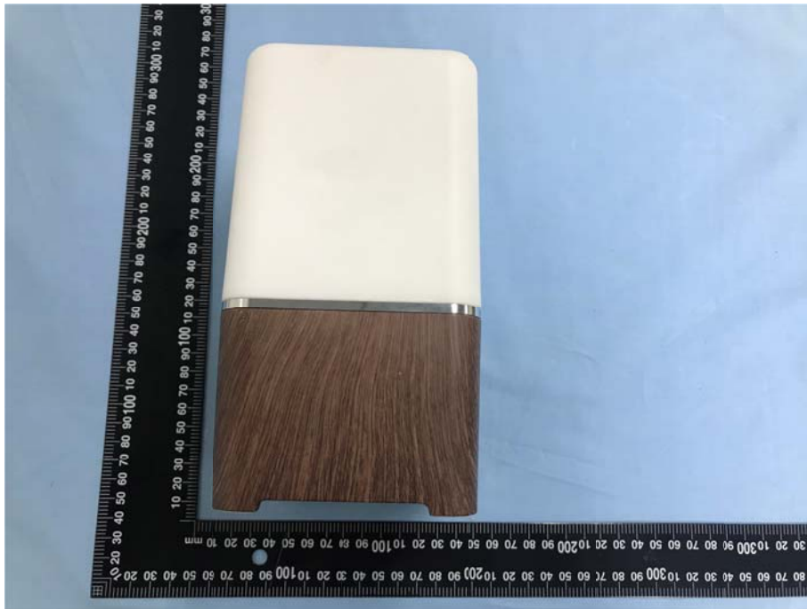
EUT View (5)