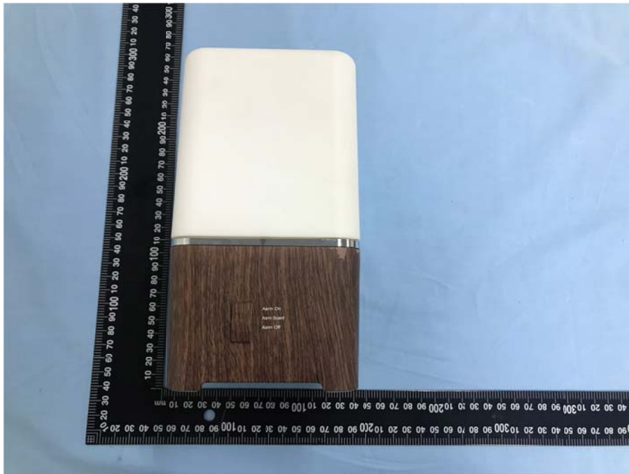
EUT View (3)