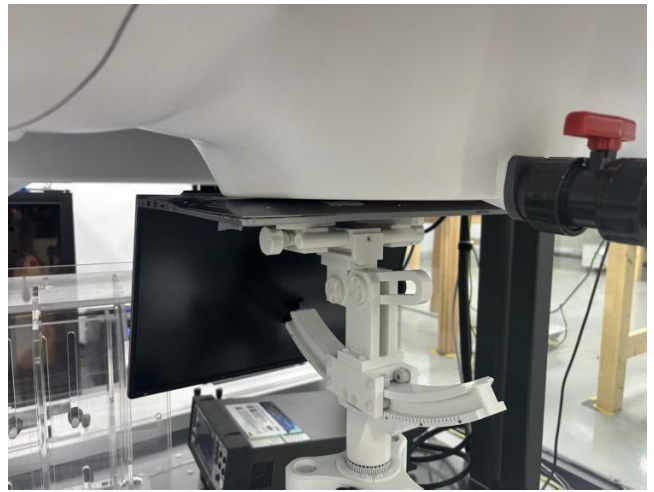
Back (dist. 0mm)