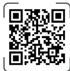
Govee Home App

This Class B digital apparatus complies with Canadian ICES-005. Cet appareil numérique de la classe B est conforme à la norme NMB-005 du Canada.