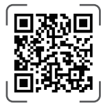
Govee Home App

For FAQs and more information, please visit: www.govee.com