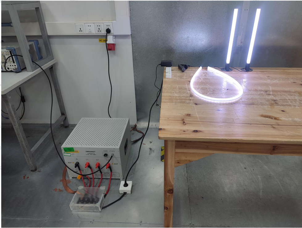
Photo of Radiation Emission Test