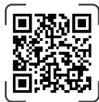
Govee Home App

For FAQs and more information, please visit: www.govee.com