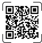
Govee Home App

For FAQs and more information, please visit: www.govee.com