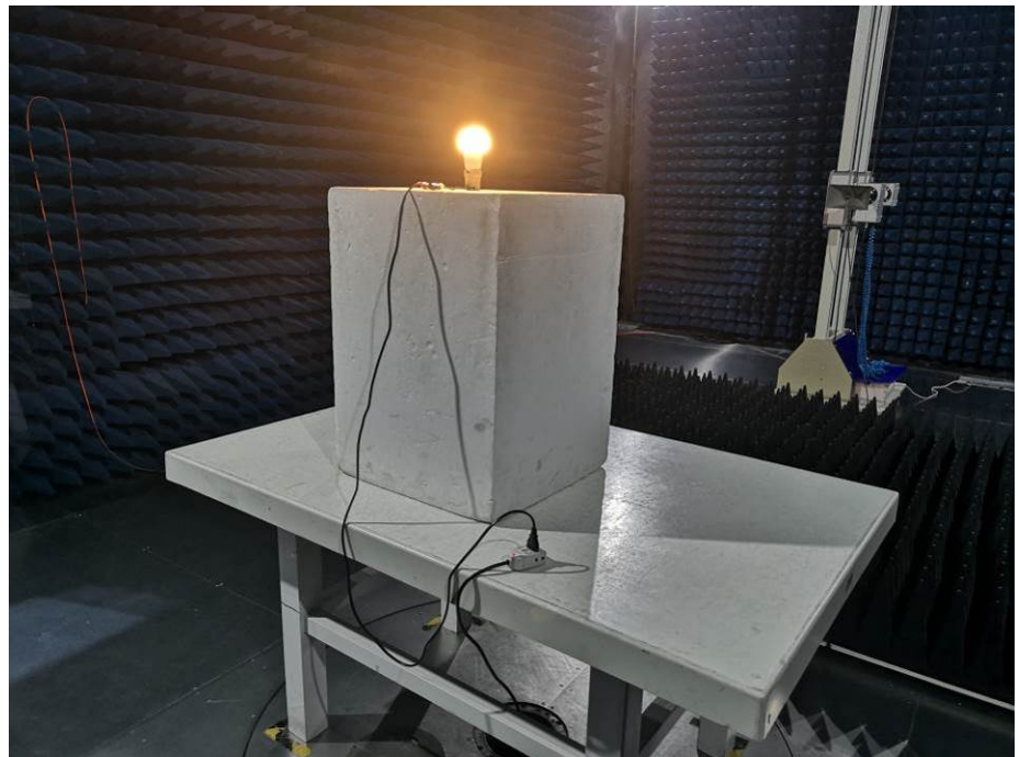
For Above 1GHz Test Site 1#