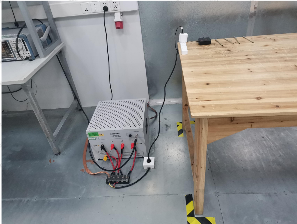
Photo of Radiation Emission Test