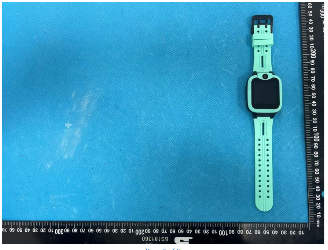
Page 5 of 9