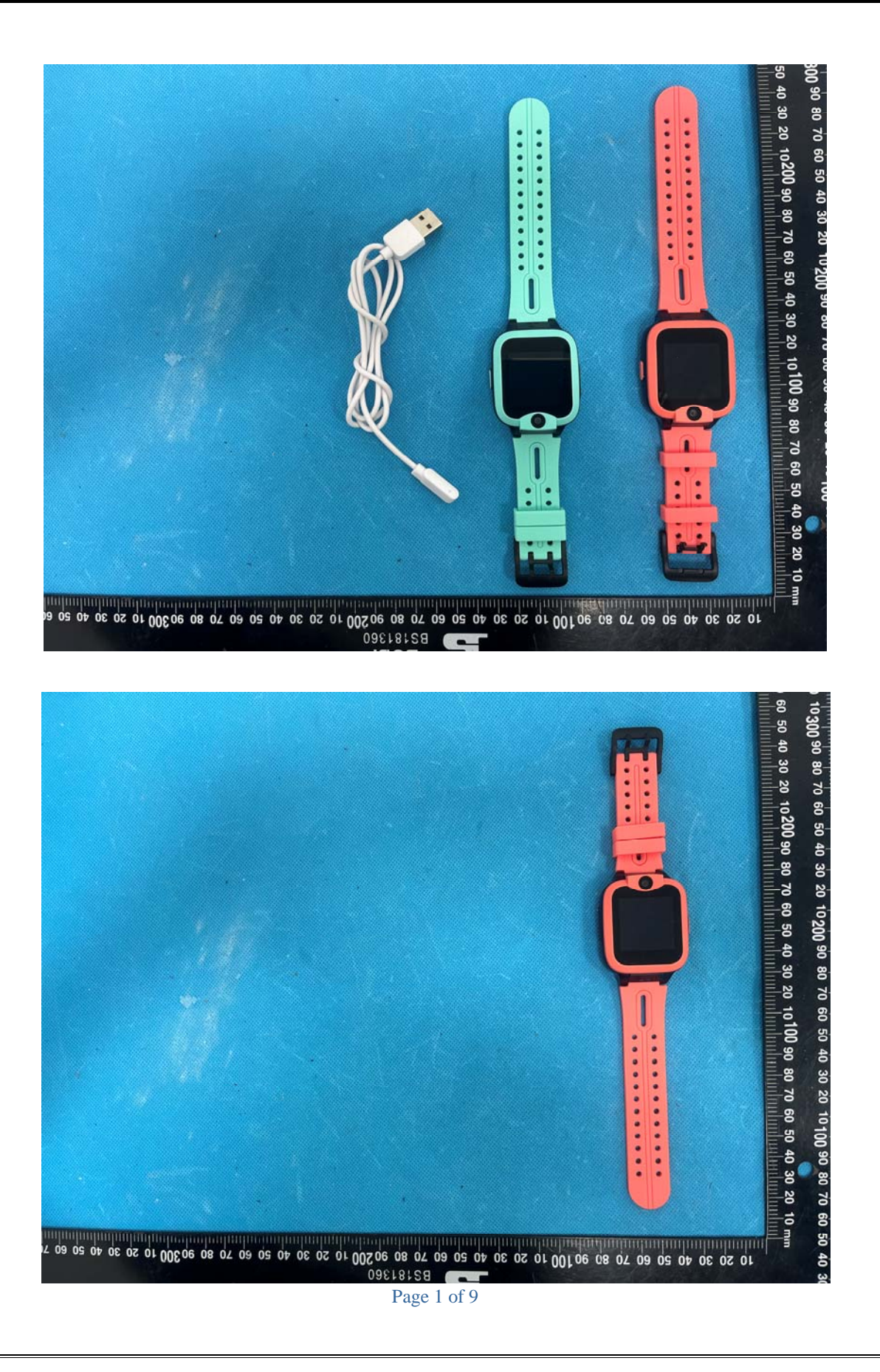
EXHIBIT B - EUT EXTERNAL PHOTOGRAPHS