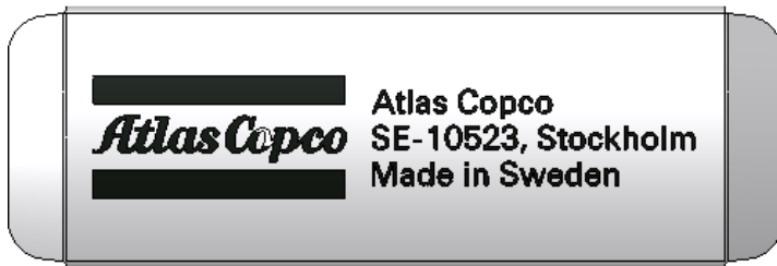
Figure 3. Marking plate left