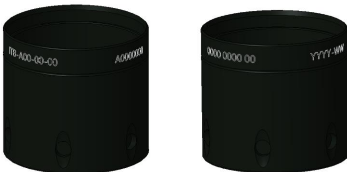
Figure 4. Laser engraved Cap nut

Laser engraving of Cap. Marked with model denomination, serial number, article number and production year and week (YYYY-WW).