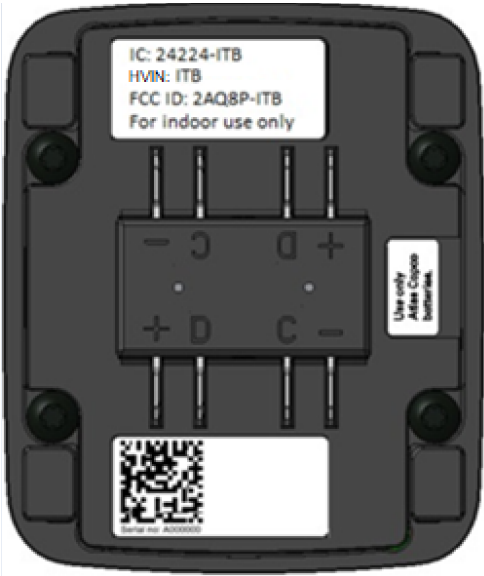
Figure 5. Labels on Power module