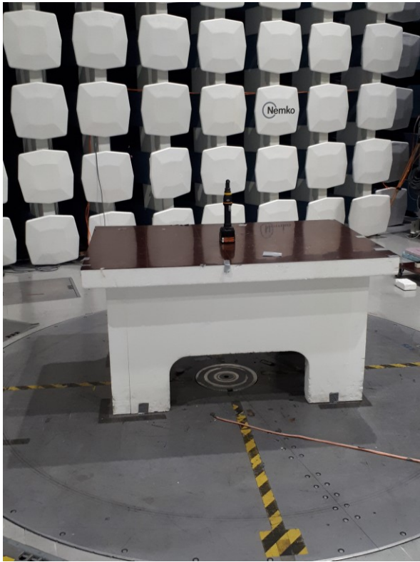
Radiated Emissions 30 – 1000 MHz