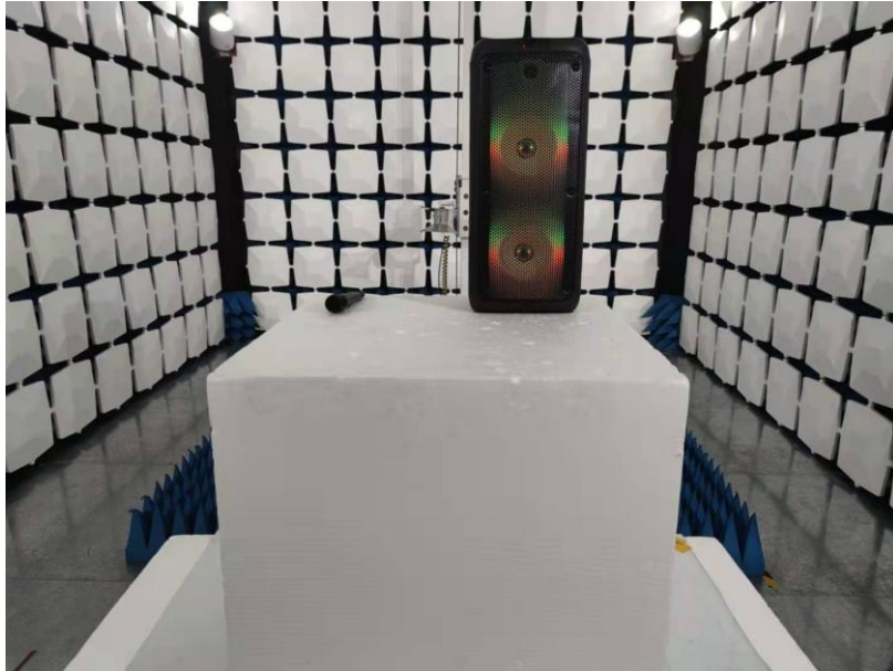
Below 1GHz for radiated emission test setup