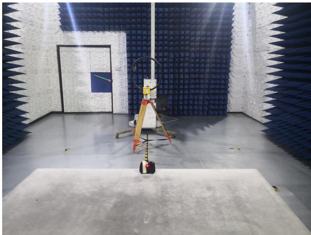
RADIATED EMISSION TEST SETUP BELOW 1GHz