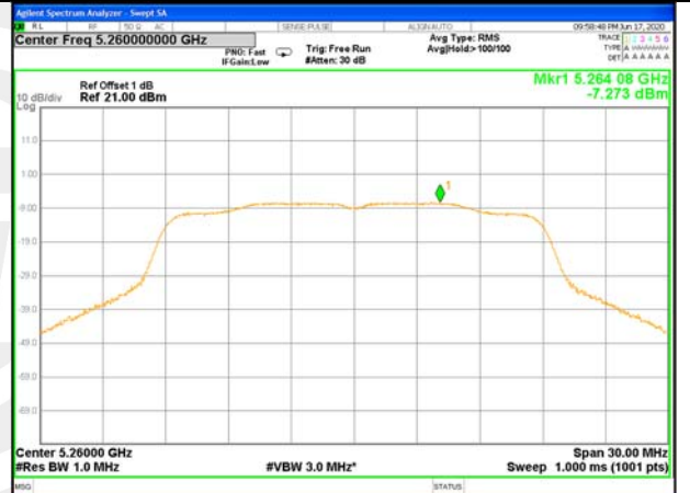
W53_11n20_Lower_Power Spectrum Density