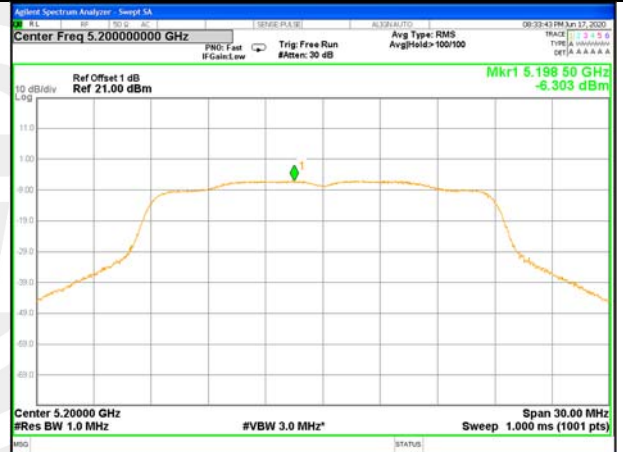
W52_11ac20_Middle_Power Spectrum Density