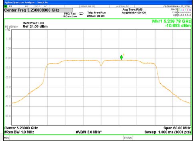
W52_11n40_Higher_Power Spectrum Density