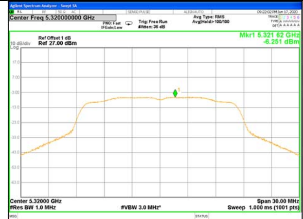
W53_11a20_Higher_Power Spectrum Density