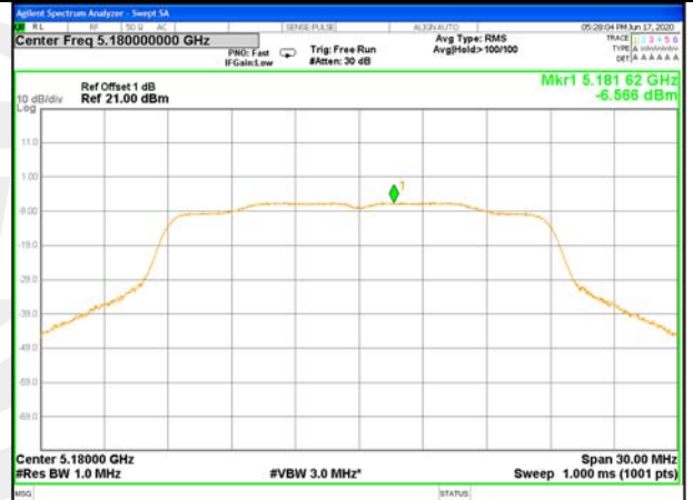
W52_11n20_Lower_Power Spectrum Density