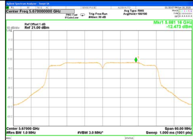
W56_11n40_Higher_Power Spectrum Density