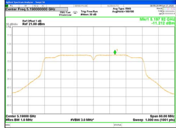
W52_11n40_Lower_Power Spectrum Density