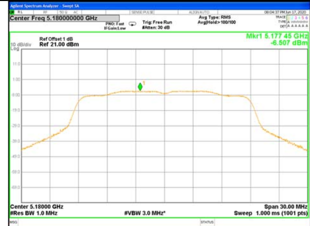
W52_11ac20_Lower_Power Spectrum Density