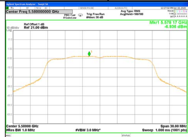
W56_11ac20_Middle_Power Spectrum Density