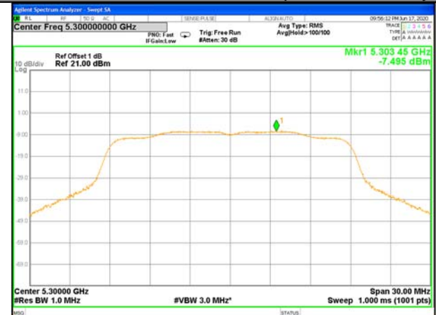
W53_11n20_Middle_Power Spectrum Density