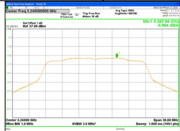
W52_11ac20_Higher_Power Spectrum Density