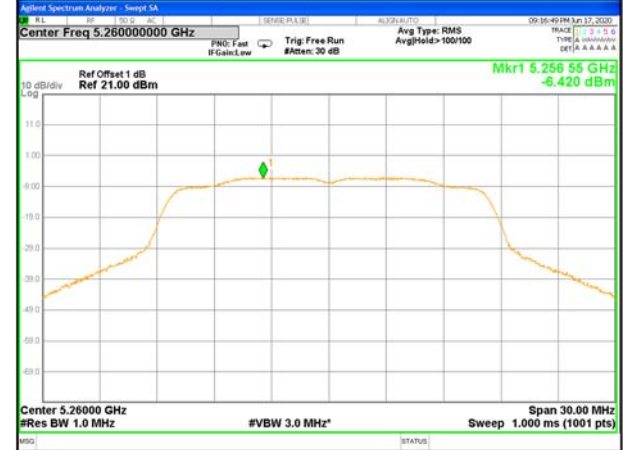
W53_11a20_Lower_Power Spectrum Density