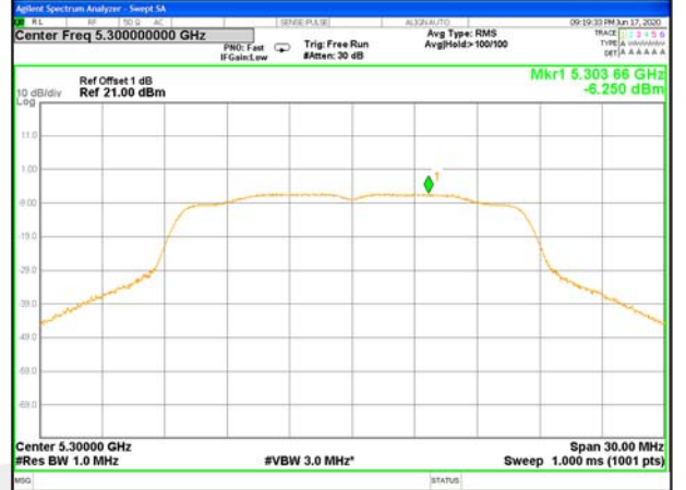
W53_11a20_Middle_Power Spectrum Density