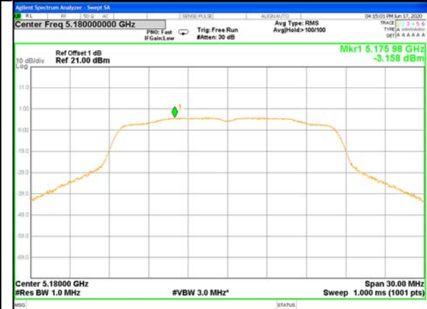
W52_11a20_Lower_Power Spectrum Density