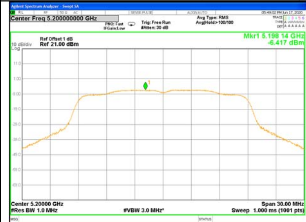
W52_11n20_Middle_Power Spectrum Density