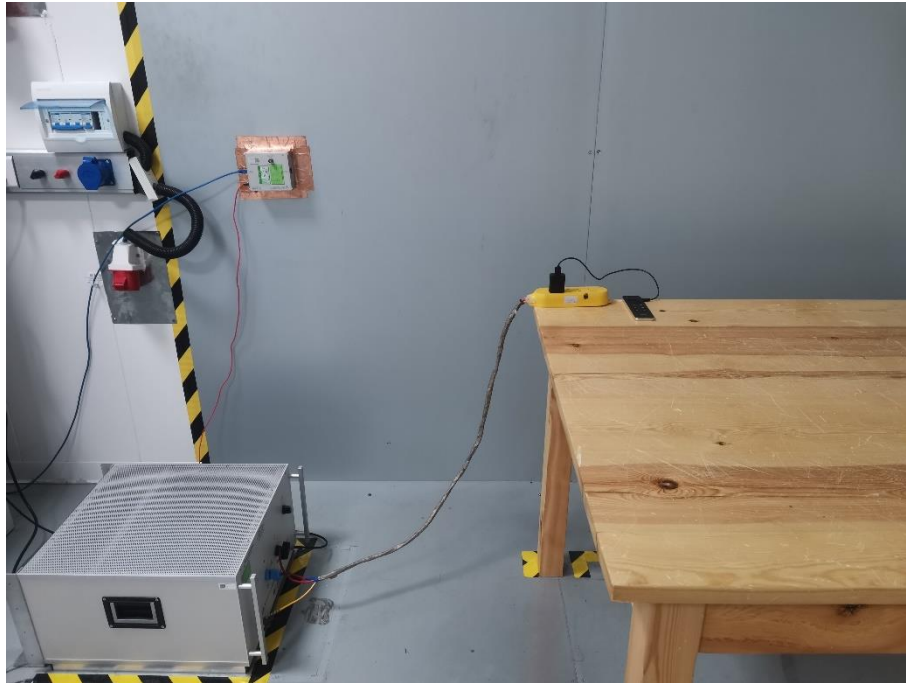
Set-up for Radiated Spurious Emission, Below 1GHz