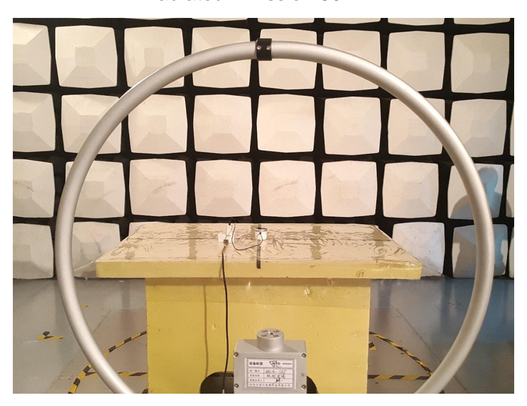
Radiated Emission Below 1G