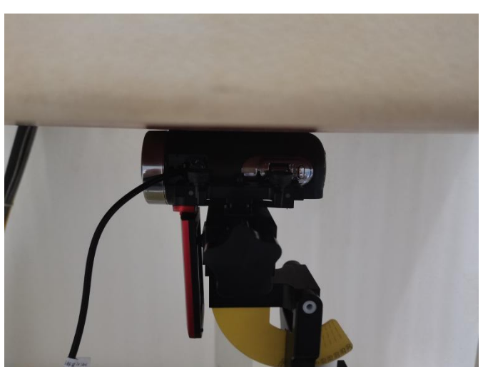
Fig-4.2 Rear Face of EUT with 0 cm Gap (Body Mode)