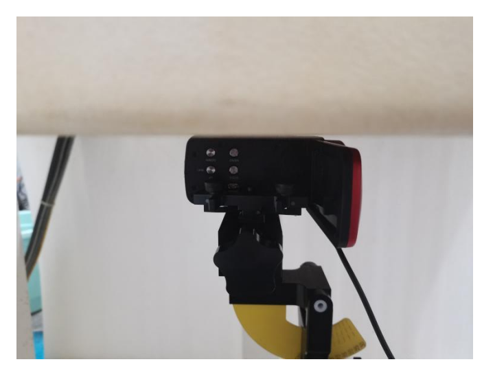
Fig-4.3 Left Side of EUT with 0 cm Gap (Body Mode)