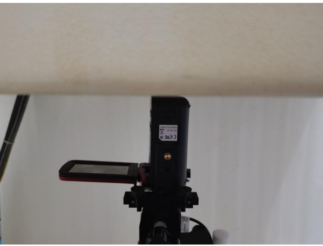
Fig-4.6 Bottom of EUT with 0 cm Gap (Body Mode)