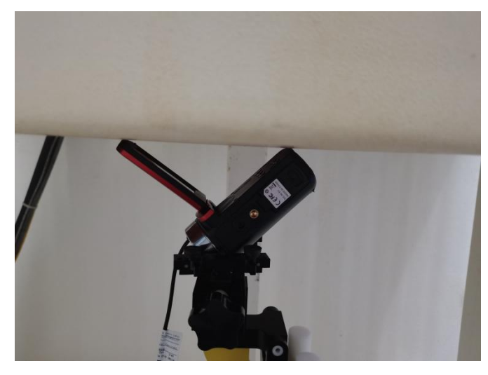
Fig-4.1 Front of EUT with 0 cm Gap (Body Mode)