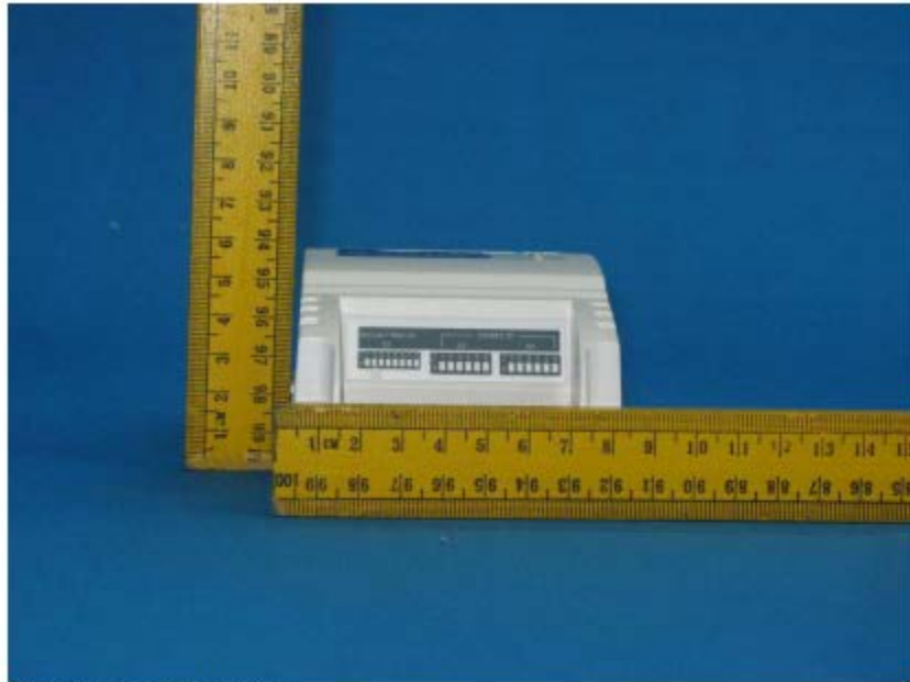
EUT Dimensional View