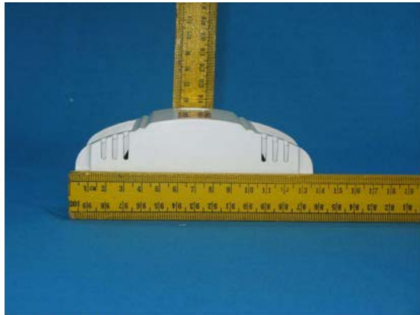
EUT Dimensional View