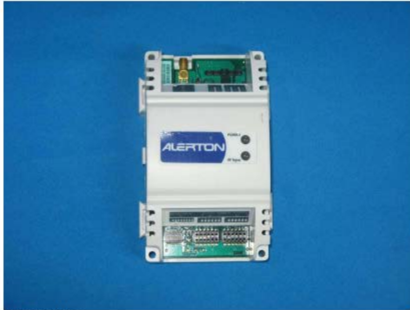
EUT Top View