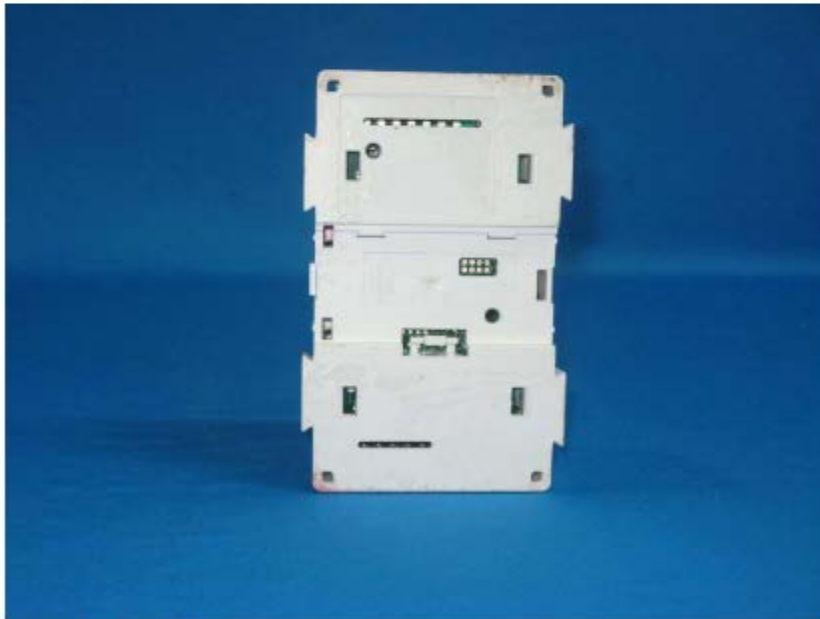
EUT Bottom View