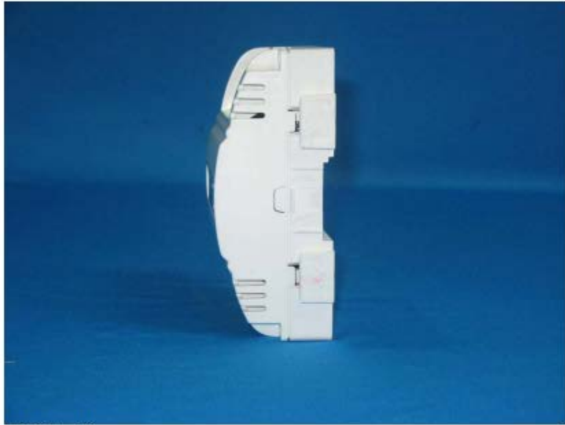
EUT Side View