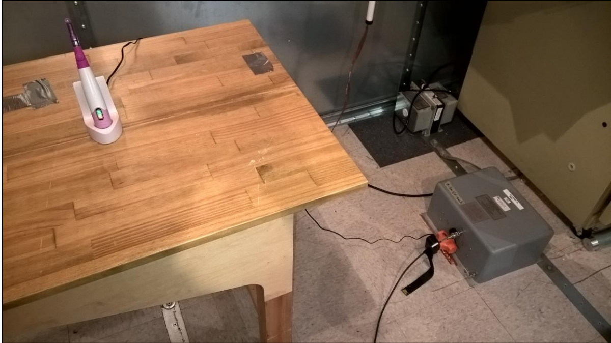
Photograph 1: Conducted Emissions at the Mains Terminal Test Setup