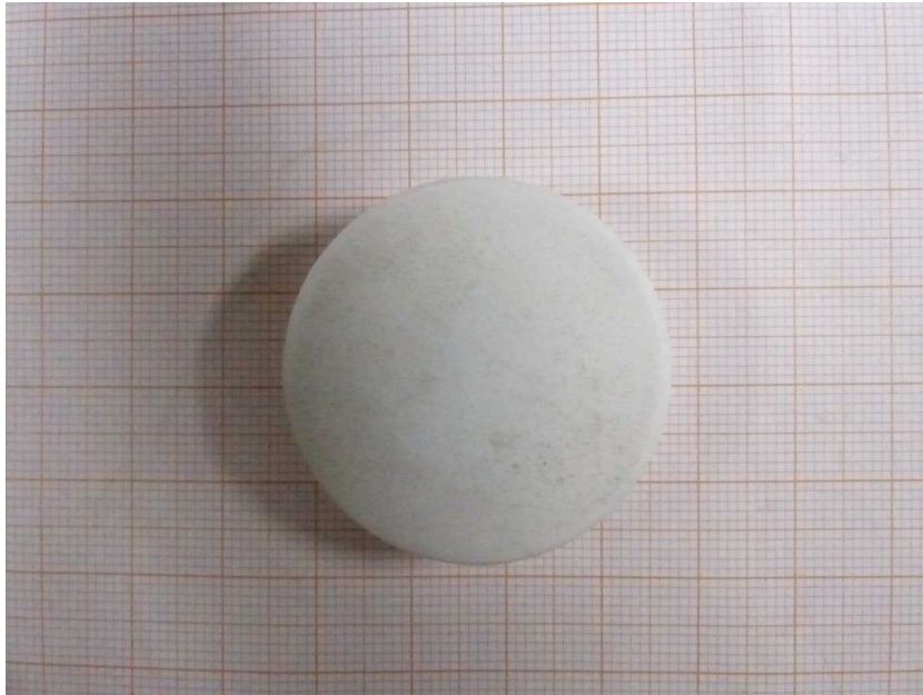
Lens LH112 rear view