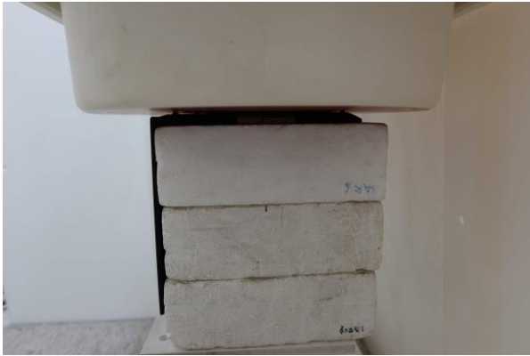
Bottom of Laptop at 0 mm