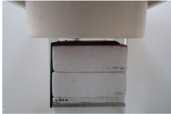
Bottom of Laptop at 12 mm