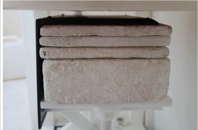
Bottom of Laptop, Test Separation 13 mm