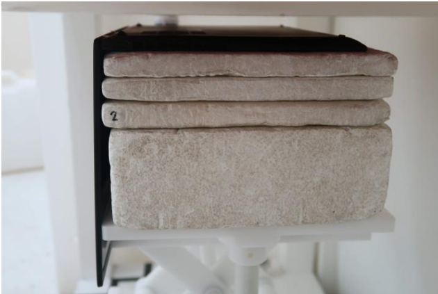
Bottom of Laptop, Test Separation 16 mm