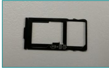
Figure 2-4 As the diagram shown, insert SIM Card and TF Card.