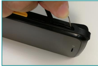
Figure 2-2 Insert the small hole with a metal pin