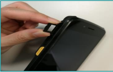
Figure 2-3 Take out the SIM Tray when it pops up.