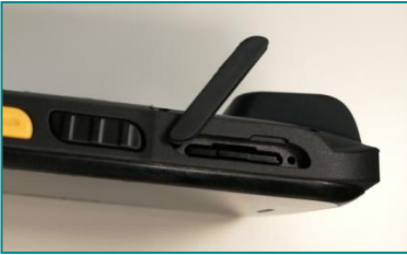
Figure 2-1 Pull out the plug

To install the microSD card and/or SIM card: