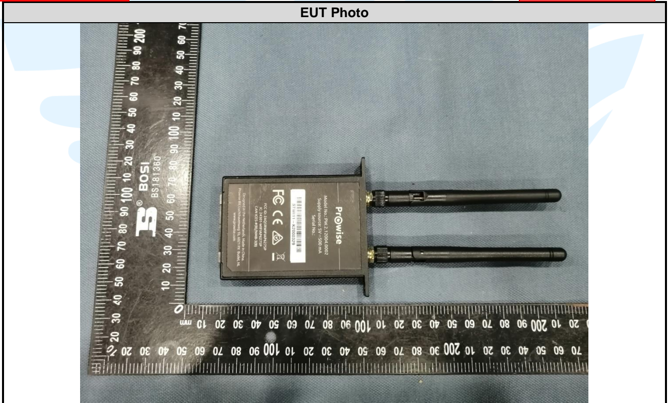
WIFI Antenna 1