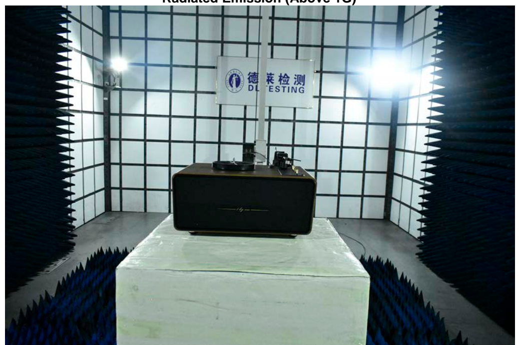
Radiated Emission (Above 1G)