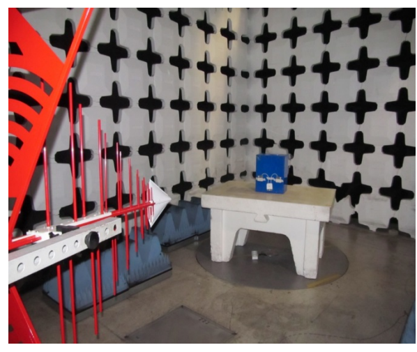
Radiated emissions test set up in 30MHz-1GHz freq. range