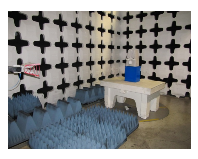
Radiated emissions test set in 1-5GHz freq. range