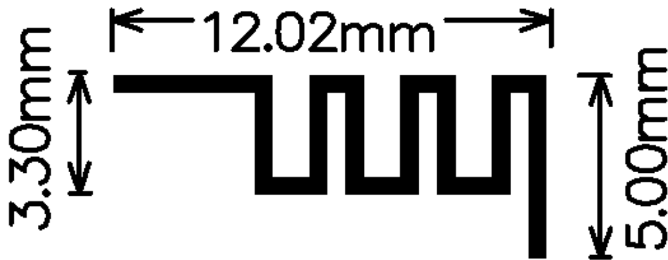
Antenna Photo & Length (mm)