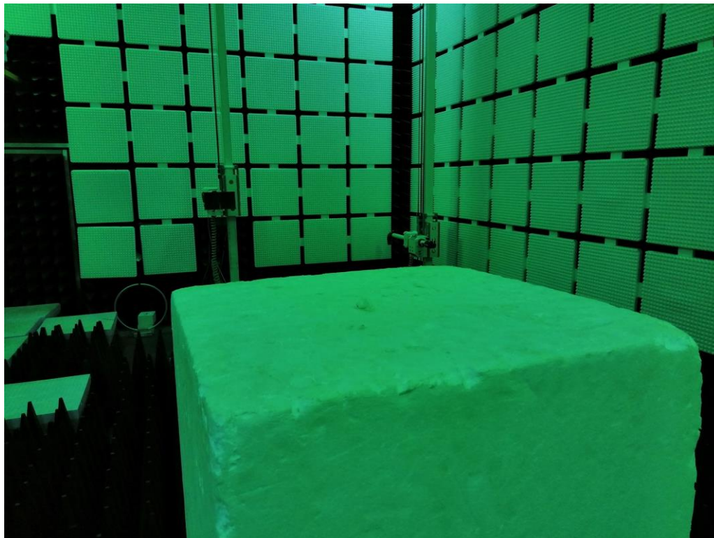
Above 1 GHz