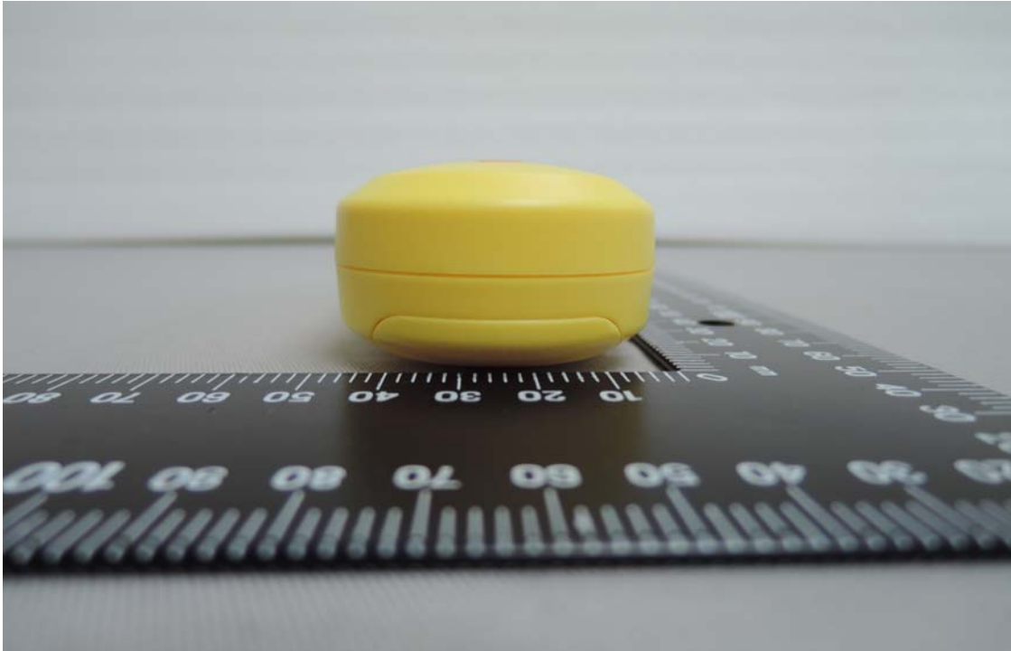
Side View of EUT – 4