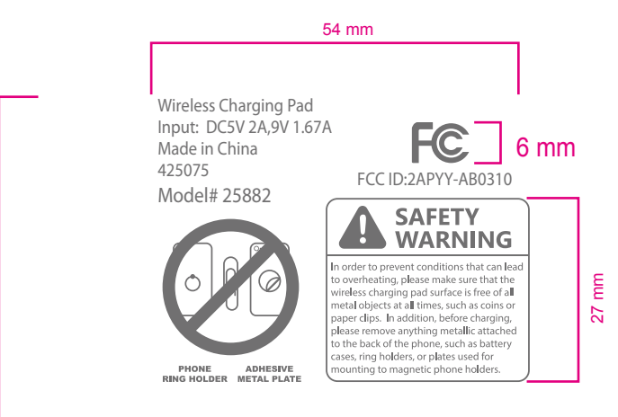
This device complies with Part 15 of the FCC Rules. Operation is subject to the following two conditions: (1) this device may not cause harmful interference, and (2) this device must accept any interference received, including interference that may cause undesired operation