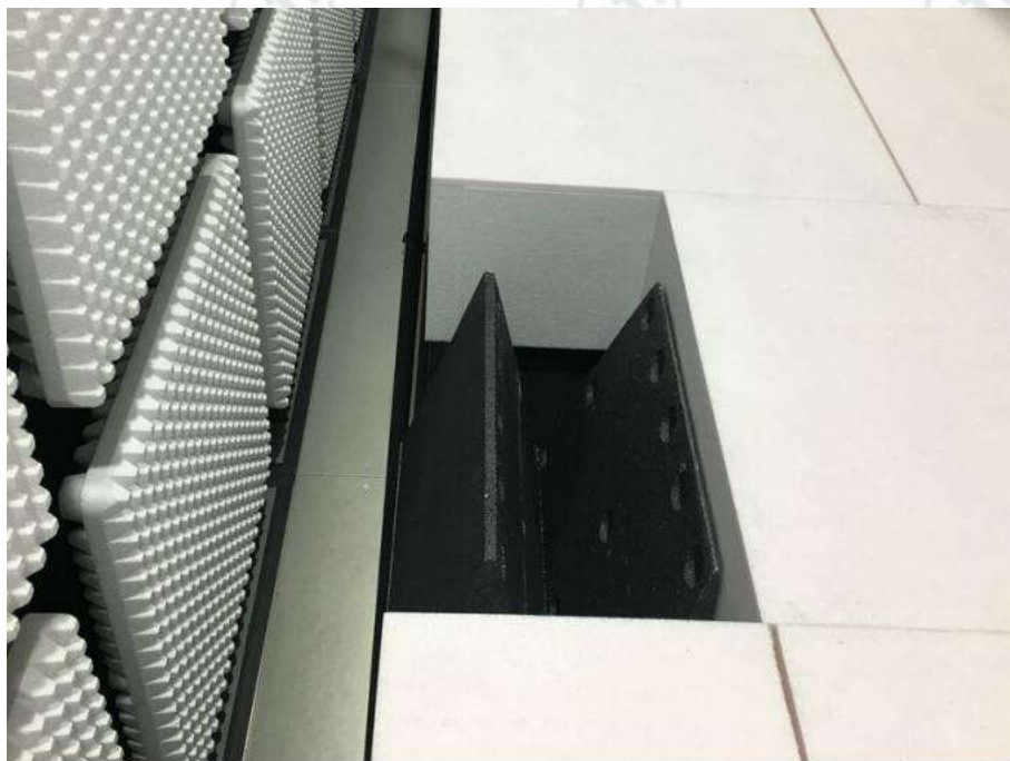
Radiated spurious emission Test Setup There are absorbing materials under the ground.