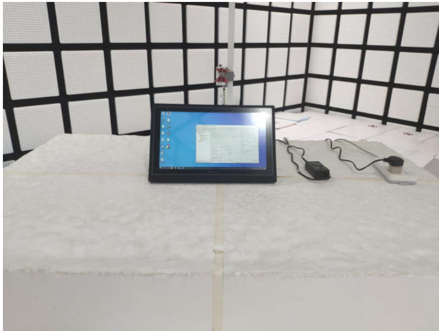
Radiated spurious emission Test Setup-3(Above 1GHz)