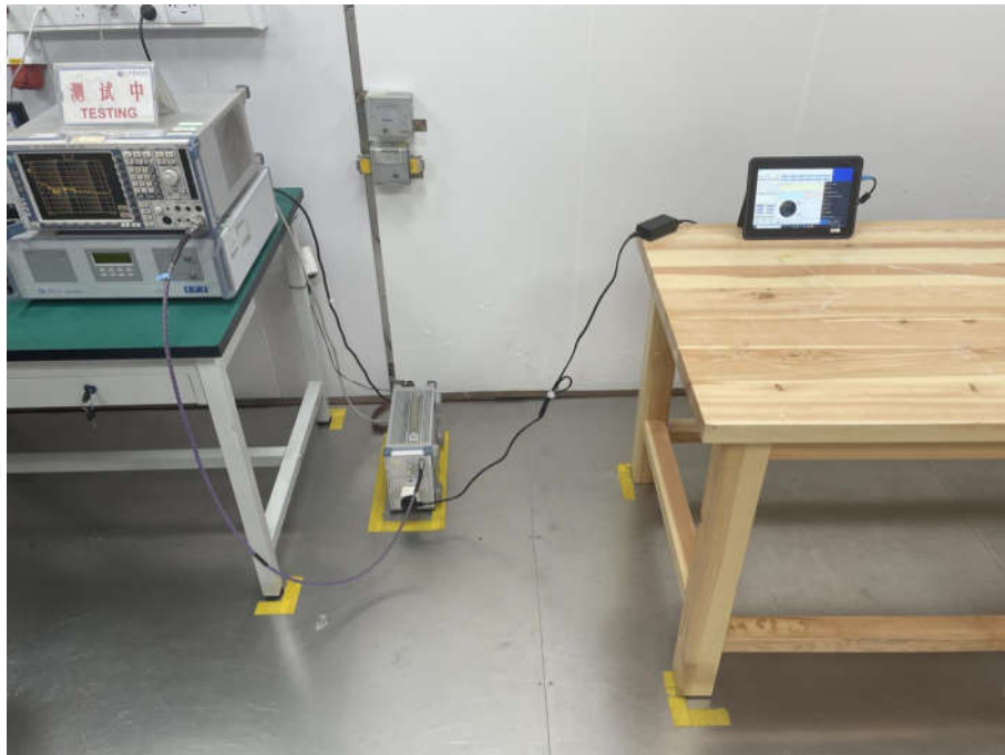
Conducted emission Test Setup