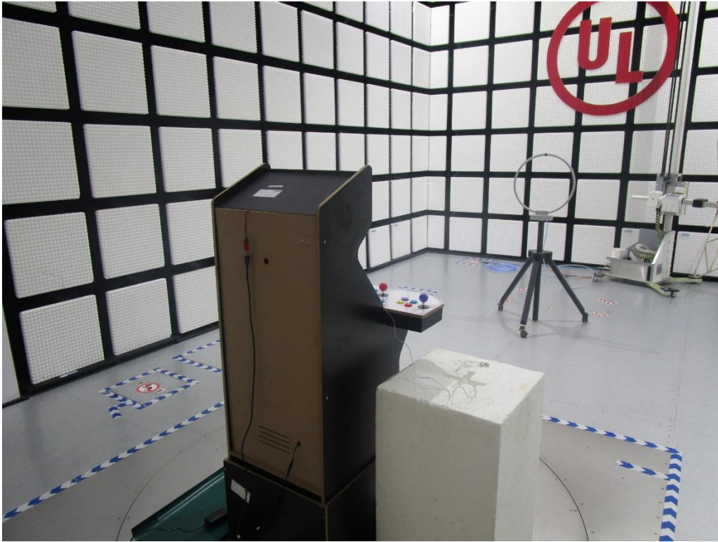
Radiated Disturbance Above 1 GHz