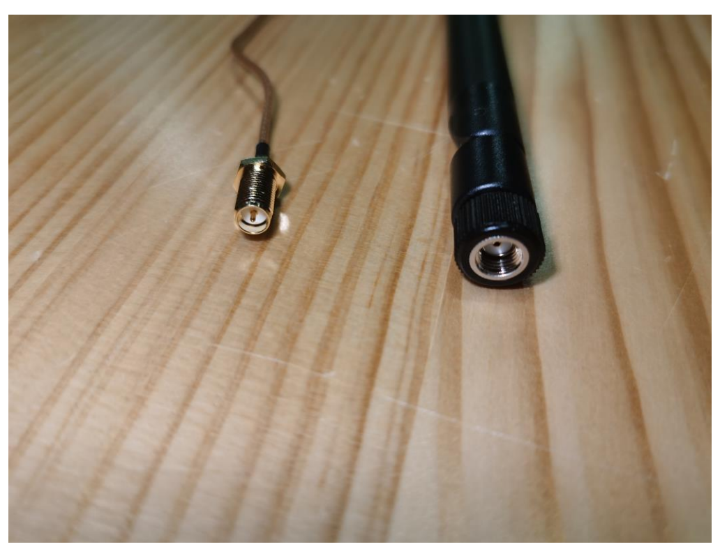
Page 3 of 8