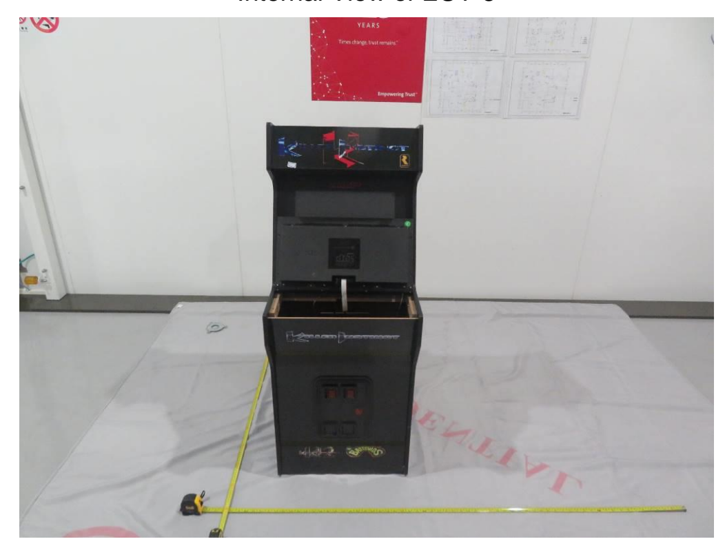
Internal View of EUT-6