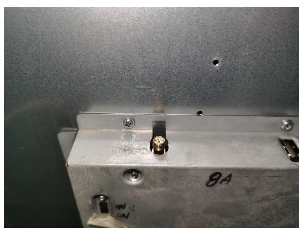
Internal View of EUT-4