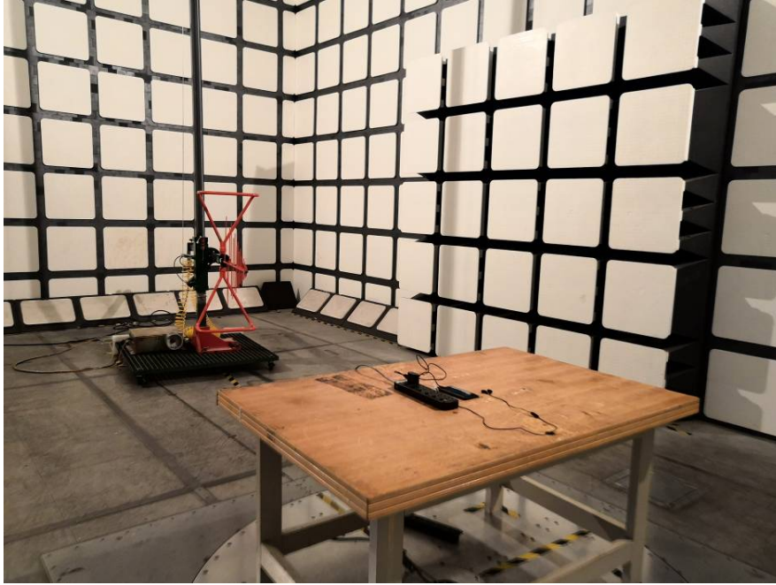
Radiated Emissions View (Above 1 GHz)