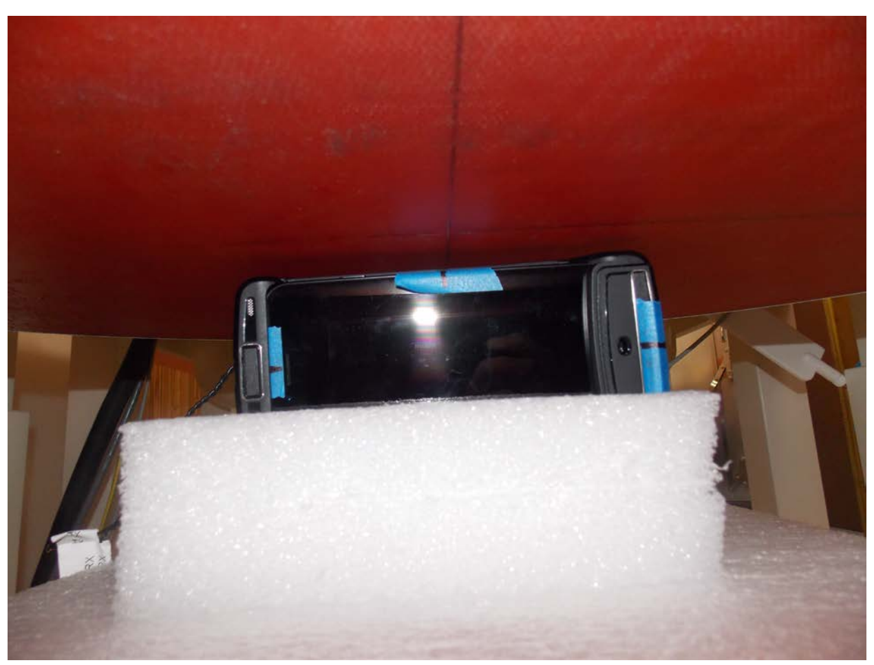
Body Left Configuration With Case 5 mm Gap