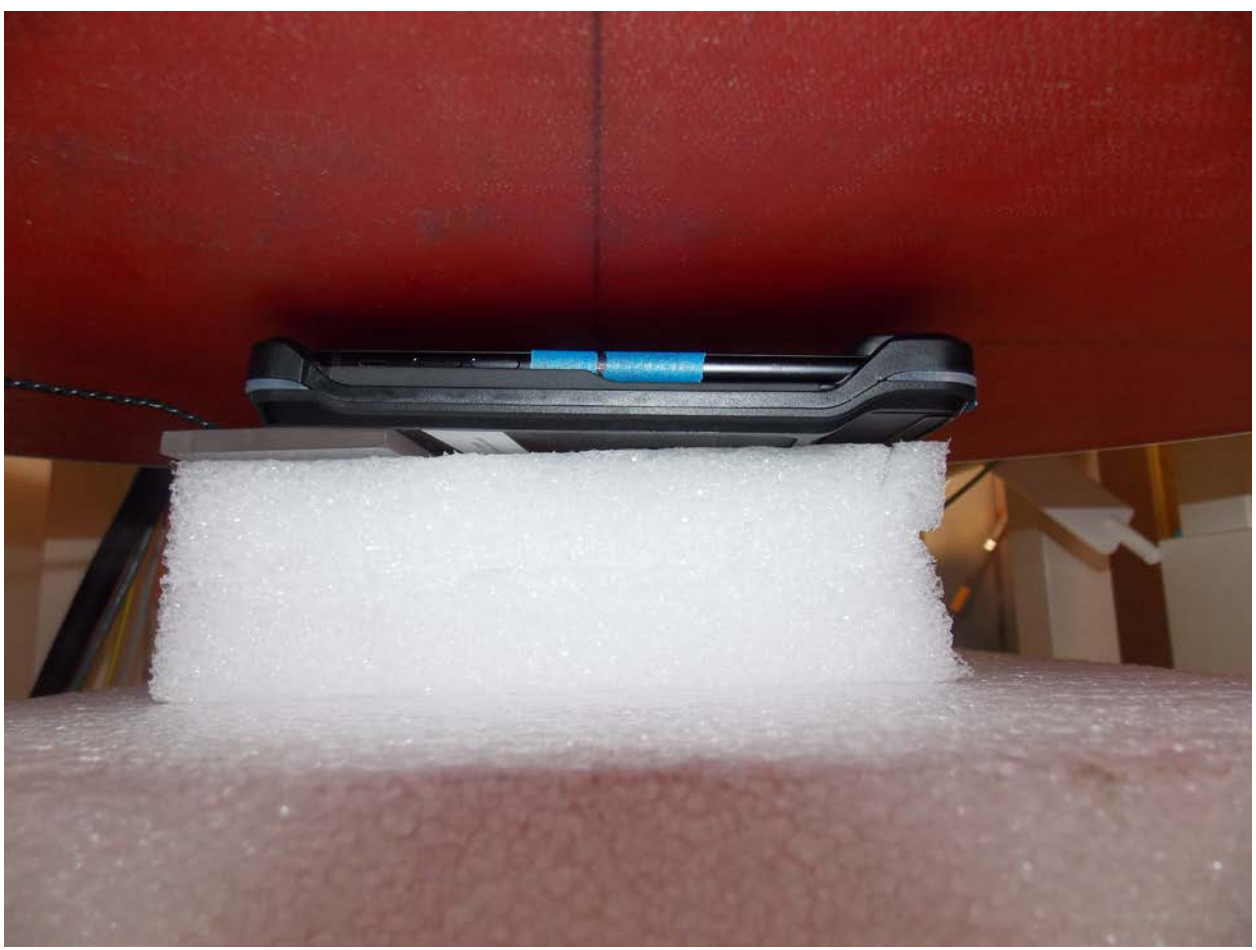
Body Front Configuration With Case 5 mm Gap