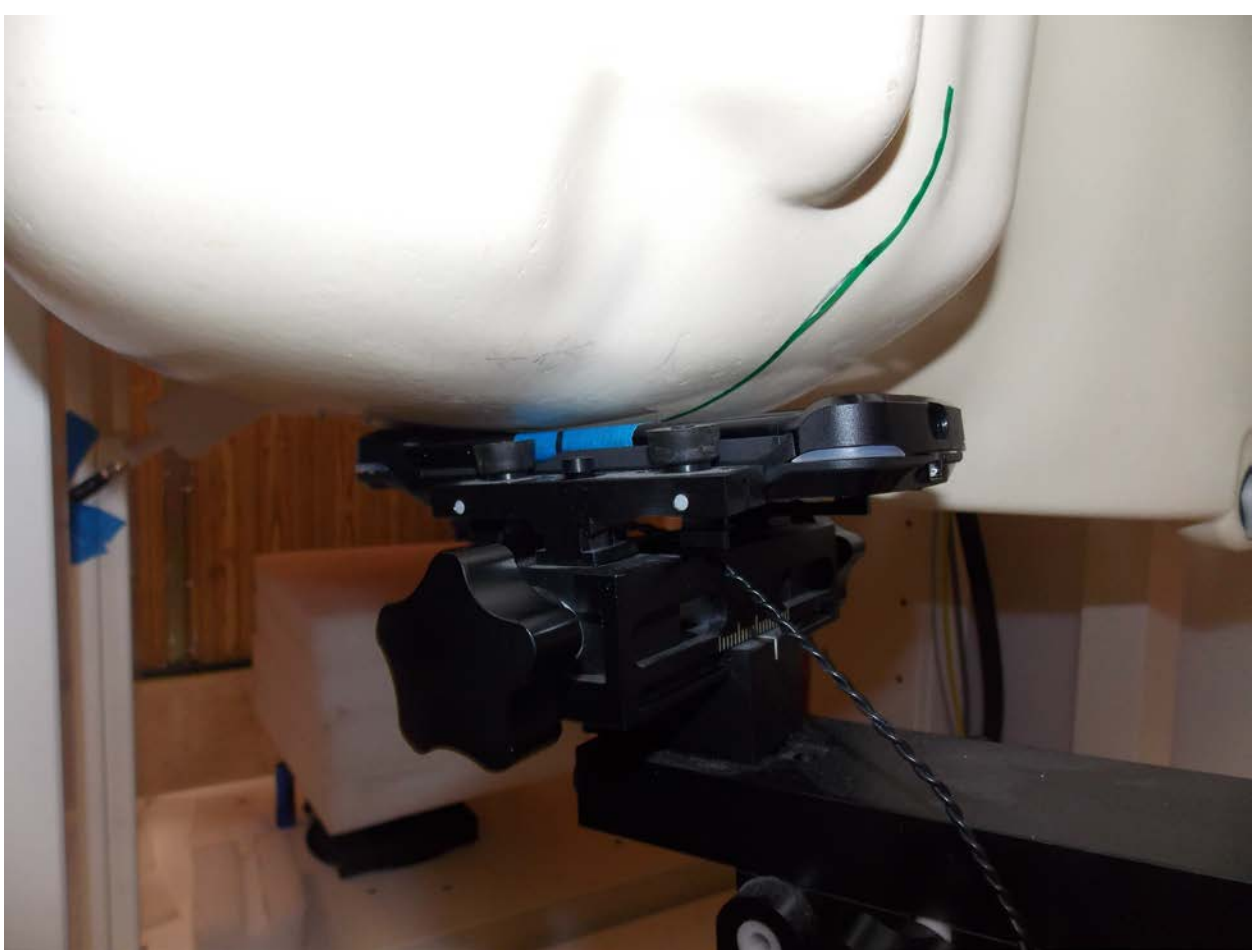
Right Touch With Case