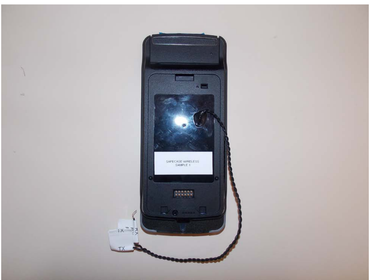
Back of Device (Case)