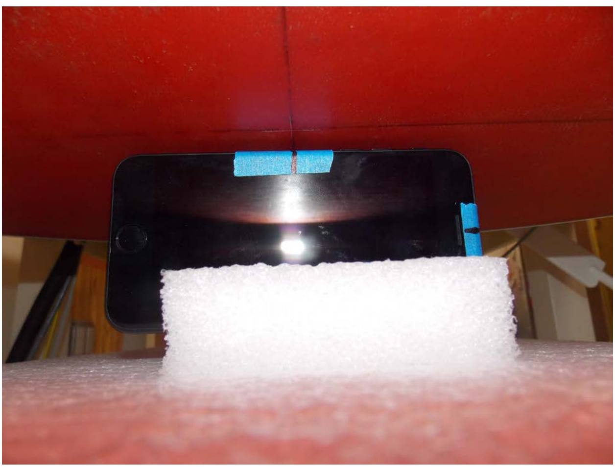
Body Left Configuration No Case 5 mm Gap