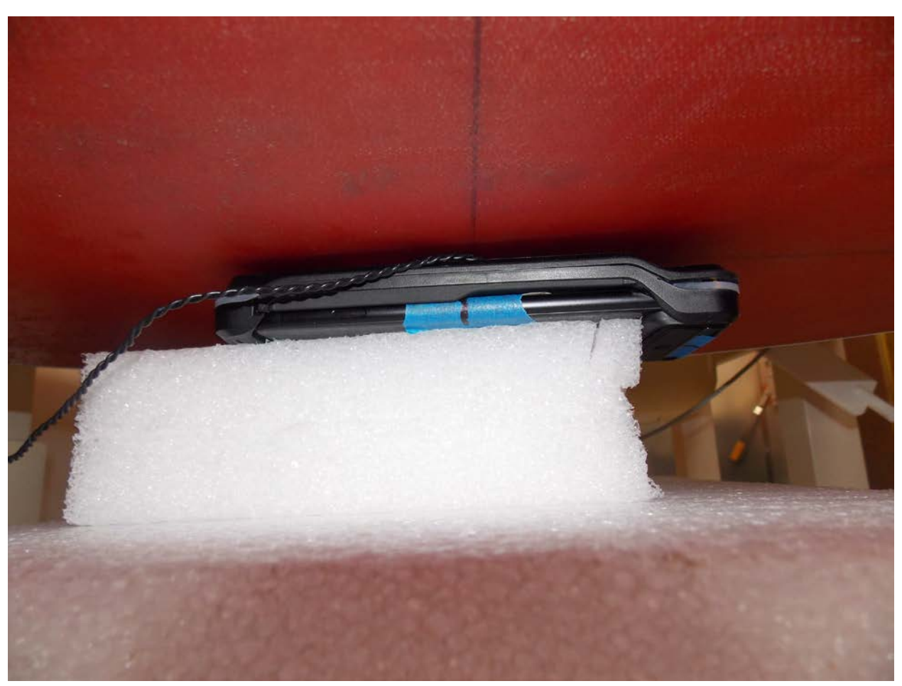
Body Back Configuration With Case 5 mm Gap