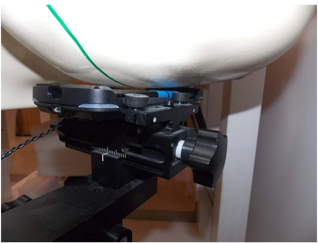
Left Touch With Case