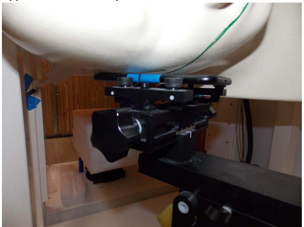
Right Touch No Case