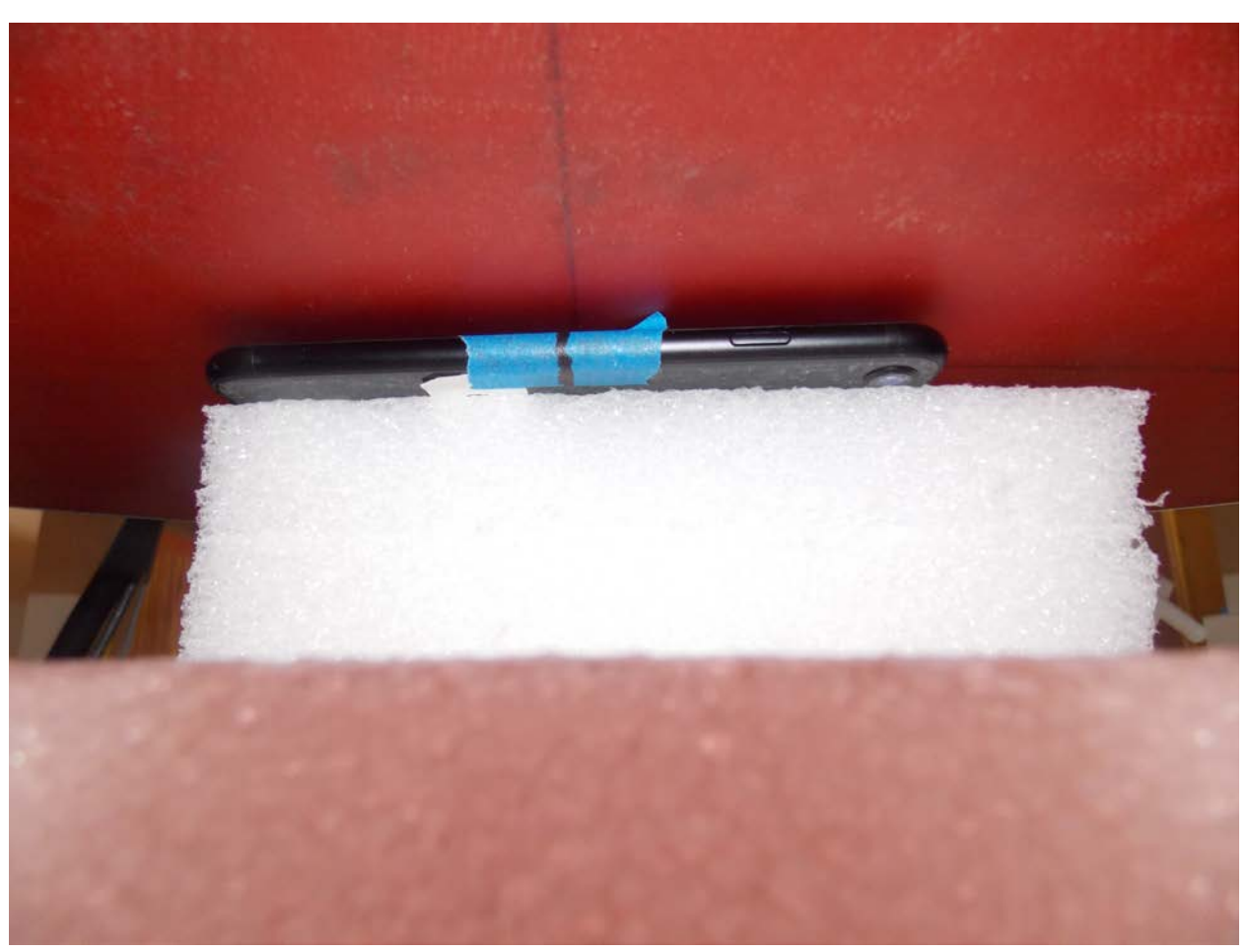
Body Front Configuration No Case 5 mm Gap