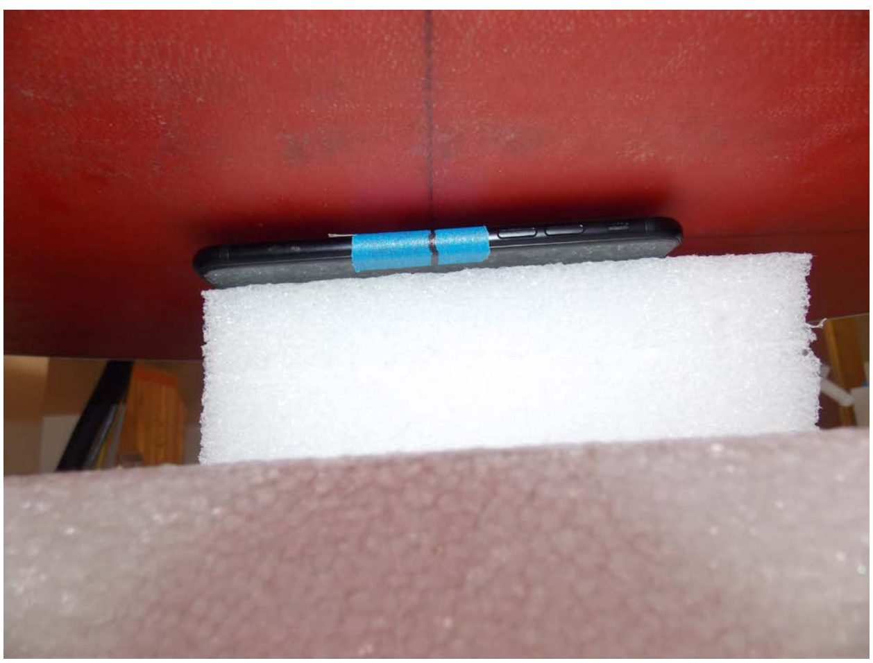
Body Back Configuration No Case 5 mm Gap