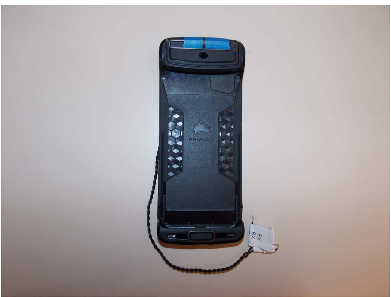
Front of Device (Case)