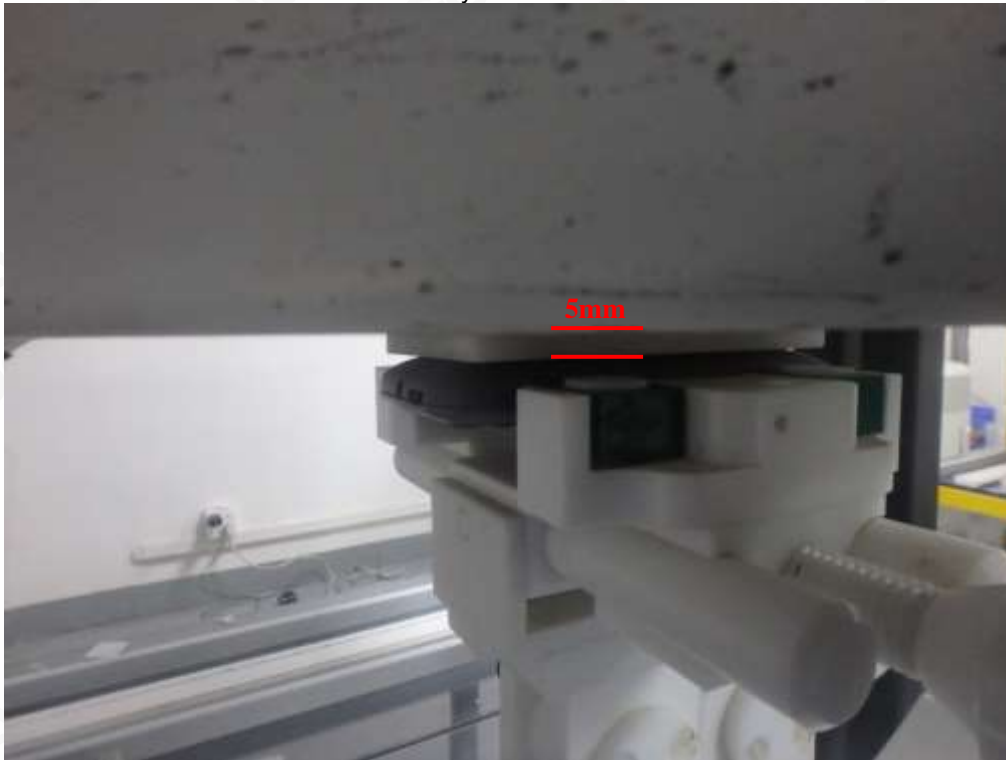
Body Front 5mm