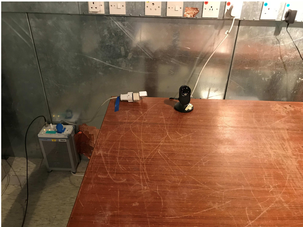
Set-up for AC power line Conducted Emission