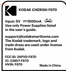
Rating Label 32.5X35mm